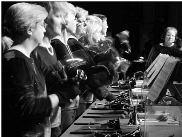
The handbell choir of Meridian Street UMC in Indianapolis provided special music during the service.

The Indiana Conference Daily HUM News is a special service provided by Indiana United Methodist Communications. The newsroom for the Annual Conference is located on the basement level of the auditorium under the stage.